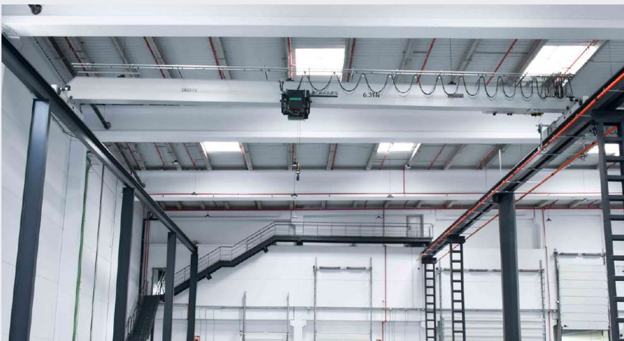
6.3Tn cable hoist in a single-girder overhead crane.