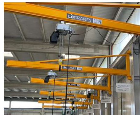
Cable hoist 5.0Tn

In addition, maintenance is easy, without the need for special tools to exchange components or install spare parts.